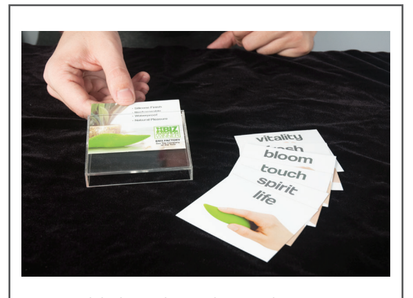
6. Slide the product cards you wish to use into the card holders.