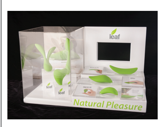
Assemble as shown. (Acrylic holders can be organized as desired).