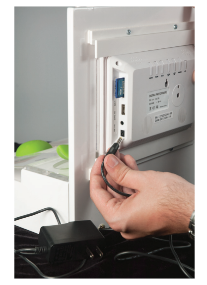
10. Plug power adapter into TV and power source.