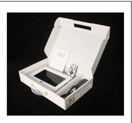
7. Unpack the contents of the TV box.