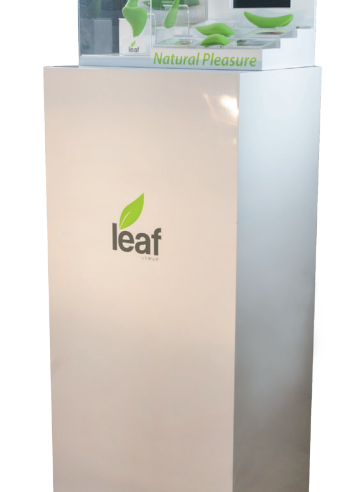
13. Carefully place assembled display on top of pedestal.

www.leafvibes.com email: sales@bmsfactory.com