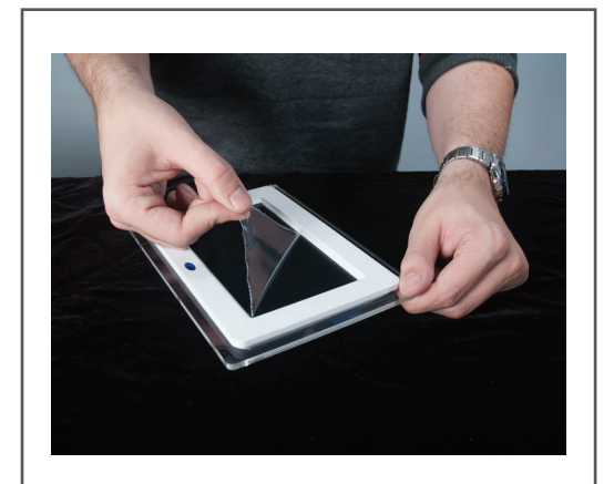
8. Remove the protective screen cover.