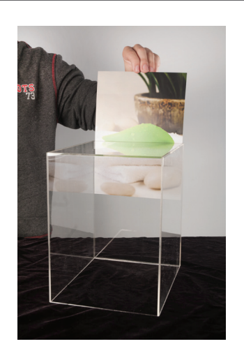
5. Slide the Leaf picture into the page holder on the clear acrylic case.