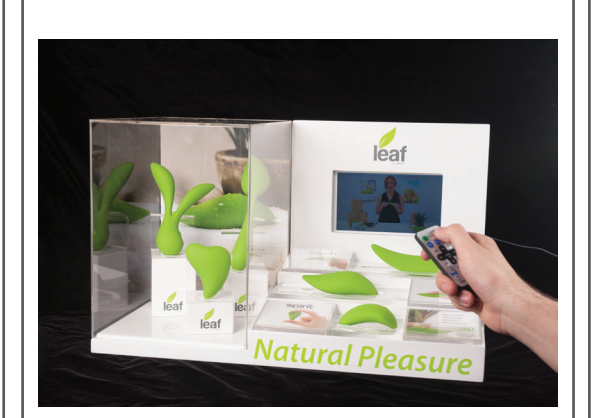
12. Please Note: TV must be removed from the display for the remote to operate.